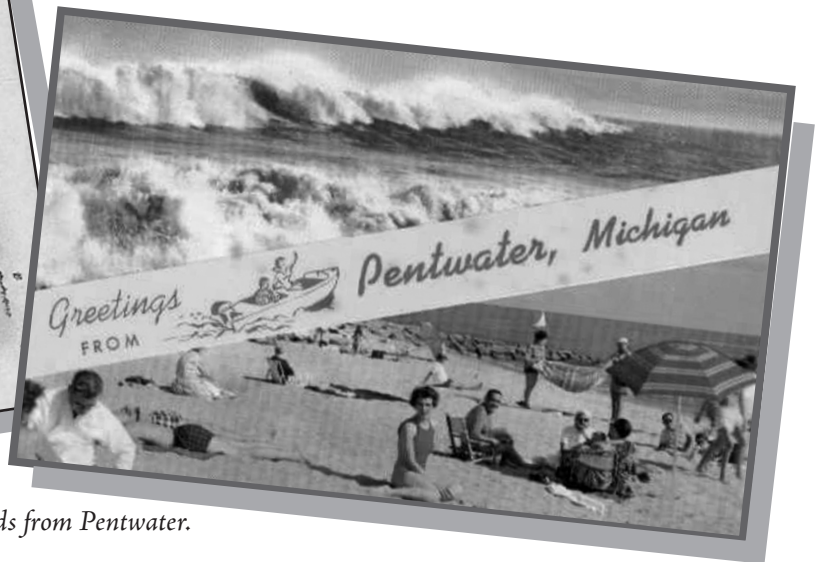
Postcards from Pentwater.