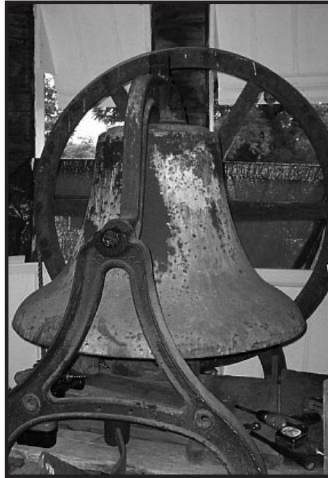
The Bell heard on every Sunday Morning from the First Baptist Church of Pentwater.

The First Baptist Church of Pentwater had its initial beginnings when a