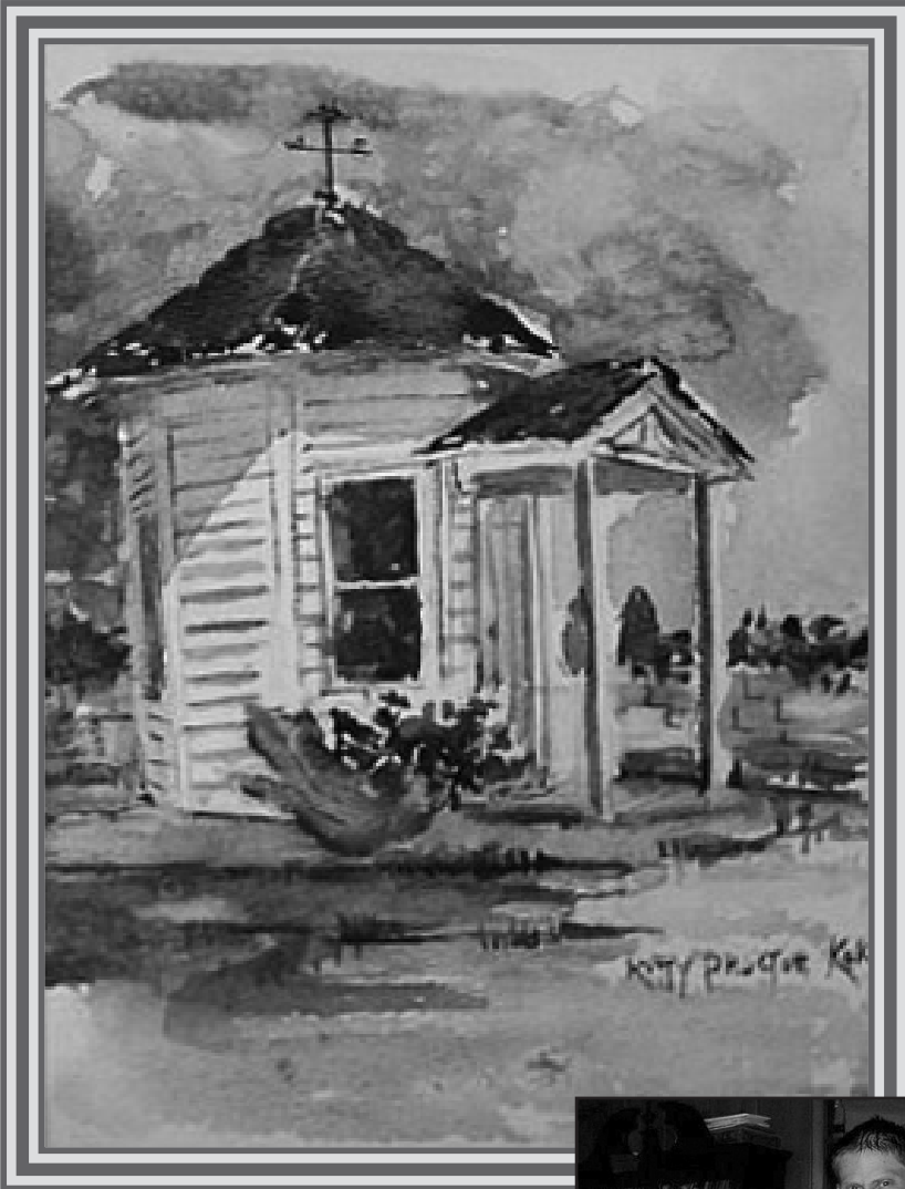
ABOVE: Kitty's charming watercolor of the Pentwater Visitor's Information Booth that was located on the Village Green.