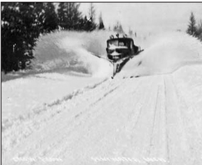
Plowing Snow in the 1950's