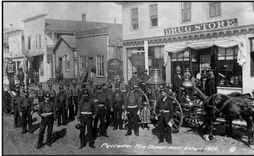
The Pentwater Fire Dept in 1900

smoke. Only about two blocks burned. The rest was not damaged. Immediately after the fire the Common Council met and as a preliminary measure passed a resolution fixing fire limits, i.e., more brick and less wood be used in building. The measure went into law stating brick be used as the primary material from what is